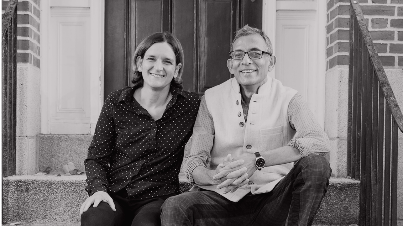
Esther Duflo, shown with her research partner Abhijit Banerjee.